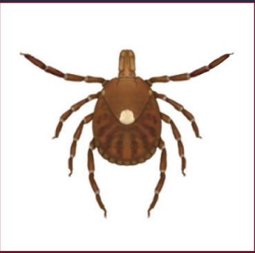
Lone Star Tick