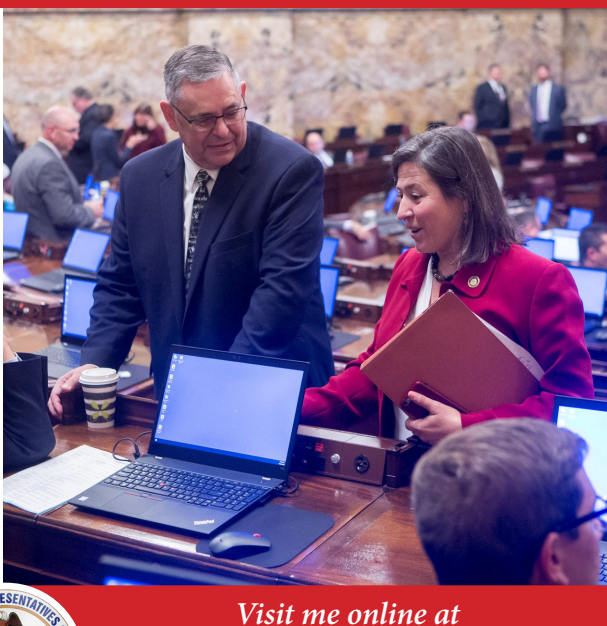
Visit me online at www.RepGaydos.com facebook.com/RepGaydos